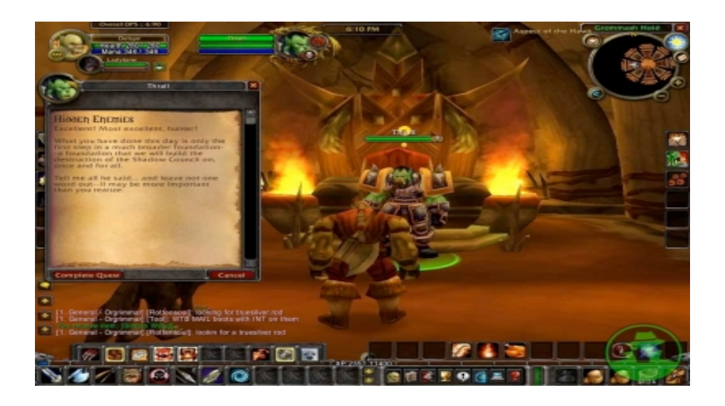
World of Warcraft

case, fantasy and the players create characters with a race, class and stats to represent their fighting abilities. In addition to the aim of going on quests and defeating adversaries in order to level up in experience, leading to better weapon and spells, there is an overarching narrative, which allows players to feel they are part a grand plot. WoW also has its own economy, and the buying and selling of items found in the world is a major part of the gameplay. Being a game-based world, it is not possible to customise the environment or build simple objects. While seemingly having limited educational potential, a large body of research has focused on WoW and other MMORPGs, specifically looking at how they can be used to offer insight into social skills and social learning, management skills, economics and language learning (Kadakia, 2005; de Freitas, 2006a; 2006b; 2008b; Warmelink, 2007; Facer et al, 2007; Wagner, 2008) . To play WoW, the user needs firstly, to purchase the software package on DVD and then pay a monthly fee for access to the game servers.